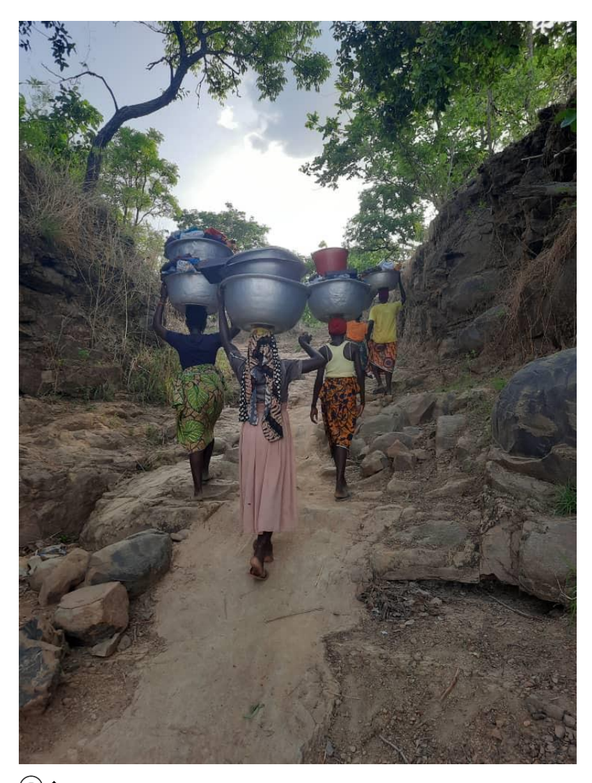
^{\odot} ^{\wedge} A group of women coming back from the river in Kukuo.