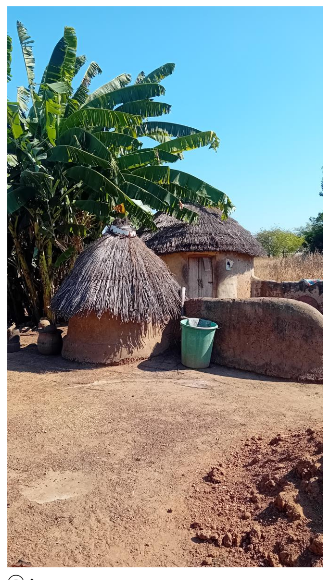
\textcircled{O} \uparrow_{\textit{A hut in Gnani camp. }}

In all the camps, the women struggle with the maintenance of their accommodation and must rely on the help of the chief or NGOs. Because they are particularly vulnerable and unable to provide adequate accommodation for themselves, the government has the duty to fulfil that basic need and failed to do so.