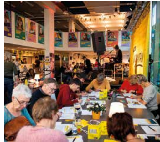
Letter writing event in Antwerp, Belgium, for Write for Rights 2022.

HAVE THE SPACE required for them to engage emotionally and develop their own attitudes.