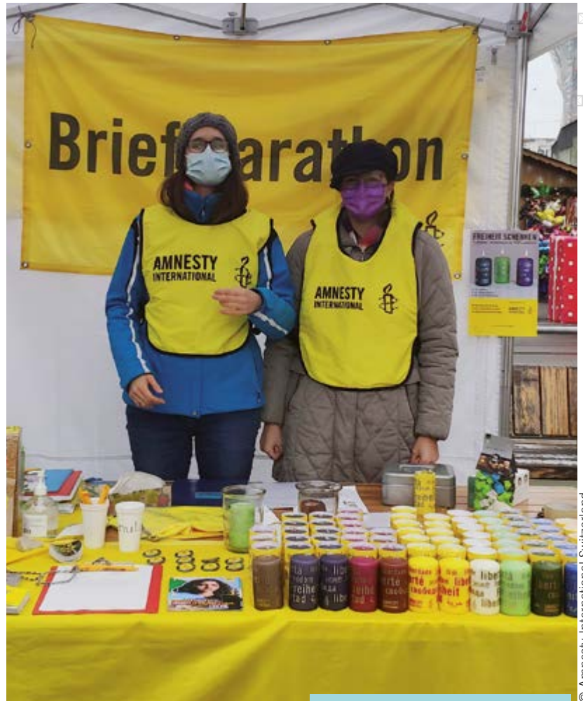
Amnesty Switzerland activists participate in Write for Rights 2021.

Human rights are not luxuries to be met only when practicalities allow.