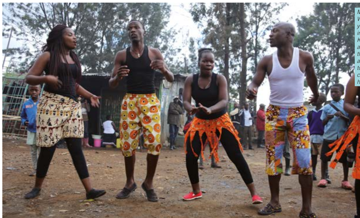
Members of the Wasanii Sanaa youth organization in Kibera slum, Kenya, use action-packed theatre, poetry and dance to teach the community about human rights.

Explain how human rights are interconnected and how violating the right to protest can also affect other human rights. For that reason, it is essential to protect the right to protest and in doing so protect other human rights.