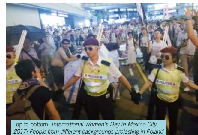
Top to bottom: International Women's Day in Mexico City, 2017; People from different backgrounds protesting in Poland in 2019 in solidarity with judges and prosecutors; Despite a violent crackdown on protests, these Sudanese women demonstrated in large numbers in 2019; Protesters dressed as police at a pro-democracy march in Hong Kong in 2014.