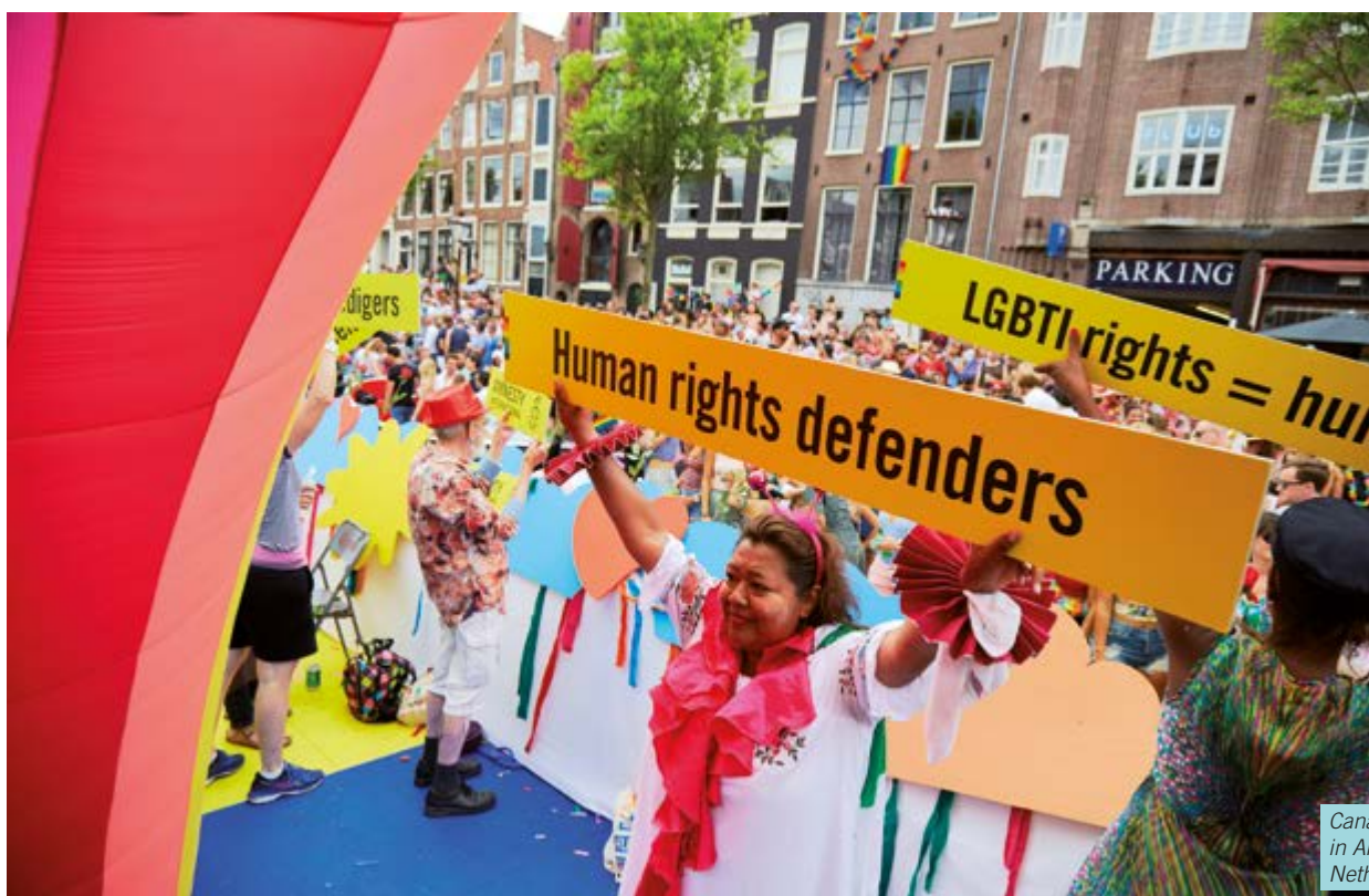
Canal Pride Parade in Amsterdam, the Netherlands, 2018.

Learn more about other activities in the Write for Rights campaign at www.amnesty.org/writeforrights/