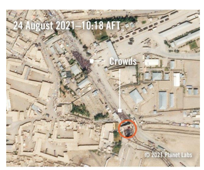
Spin Boldak-Chaman crossing. 24 August 2021.

For instance, according to UNHCR, Pakistan closed its border with Afghanistan, except for people in need of medical treatment, or with a proof of residency. Despite that, at the Spin Boldak-Chaman border crossing in Kandahar, people with Tazkira (National ID Card) from Kandahar, Helmand, Zabul, and Uruzgan were allowed to cross the border. Between 2 August 2021 and 24 August 2021, the crowds attempting to cross the border to Pakistan via the Spin Boldak crossing increased exponentially, as documented via satellite imagery (see above) and video analysed by Amnesty International.