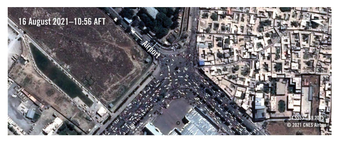
Kabul Airport vicinity. 16 August 2021.

In this report, Amnesty International, International Federation for Human Rights (FIDH) and the World Organisation against Torture (OMCT) have documented incidents of human rights violations that have taken place in Afghanistan since the takeover by the Taliban on 15 August. This report calls on the UN Human Rights Council (UNHRC) to take decisive action to establish a robust independent investigative mechanism to monitor and report on human rights abuses committed in violation of international human rights law, and to contribute to accountability for crimes under international law. Human rights defenders, journalists, and others who are targeted for their work must be evacuated and given safe passage if they wish to leave Afghanistan; and women and girls, and ethnic and religious minorities who are targeted because of their gender, ethnic, and religious identity, must be guaranteed protection. All those who wish to leave Afghanistan must be assured the right to seek asylum. At the same time, the Office of the Prosecutor of the International Criminal Court must receive assistance from the international community to immediately recommence its investigations into crimes under international law committed in Afghanistan.