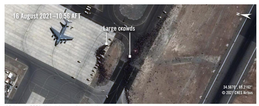
16 August 2021. Kabul Airport.

The thousands who are left behind, or are trying to leave Afghanistan, are testament to the brutal regime of the Taliban circa 2001, when extrajudicial executions abounded, and women and girls were oppressed with a plethora of restrictions. Since then, even in the last 20 years, the Taliban and other armed groups have conducted brutal attacks on civilians, journalists, human rights defenders, and government workers, resulting in Afghanistan having one of the highest civilian deaths in the world. Nearly 50,000 civilians have died in the last 20 years. The first half of 2021 alone recorded 5183 civilian casualties (1,659 deaths and 3,524 injuries), of which 32 per cent were children. This is a 47 per cent increase in civilian casualties compared to the same period in 2020. Those responsible for these casualties include both anti-government and pro-government forces.