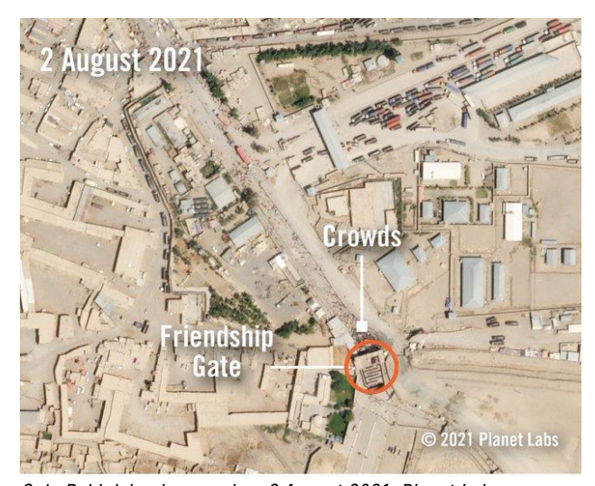
Spin Boldak border crossing. 2 August 2021.

Afghans who tried to cross land borders, an Afghan researcher, and the UN agency in charge of refugees (UNHCR), all told Amnesty International that the Afghan people were also prevented from seeking refuge abroad because most of the land border crossings were closed for asylum seekers. 185