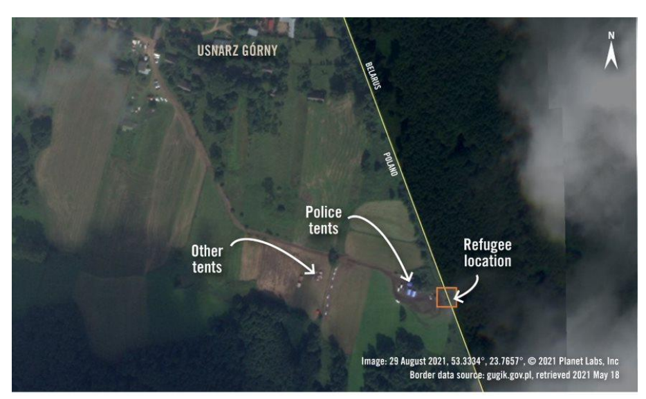
Poland-Belarus Border. 29 August 2021.