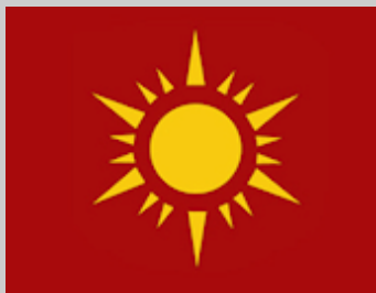
The insignia of the Myanmar Army's Northeast Command

Operationally, the Myanmar Army is comprised of two command structures: the regional commands, which oversee the Army's actions in specific geographic areas; and the combat divisions, which are moved around the country to areas of high priority. Civilians in northern Shan State implicated soldiers from the Regional Command and from different combat divisions in violations.