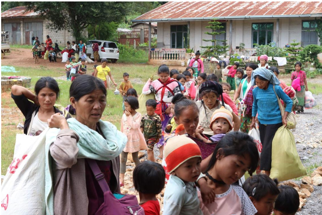
👁️ ↑ Civilians from villages in Kutkai Township being evacuated to a monastery on 25 August 2019.

Displacement by its nature often affects people’s ability to access to key services, in particular healthcare. In cases of temporary displacement, it can be difficult for humanitarian workers to get to affected communities quickly, in part because it takes time to confirm the location of displaced communities and mobilize resources. Humanitarian workers told Amnesty International that because of the temporary nature of displacement, villagers may have already returned home before aid and assistance can reach them. 225