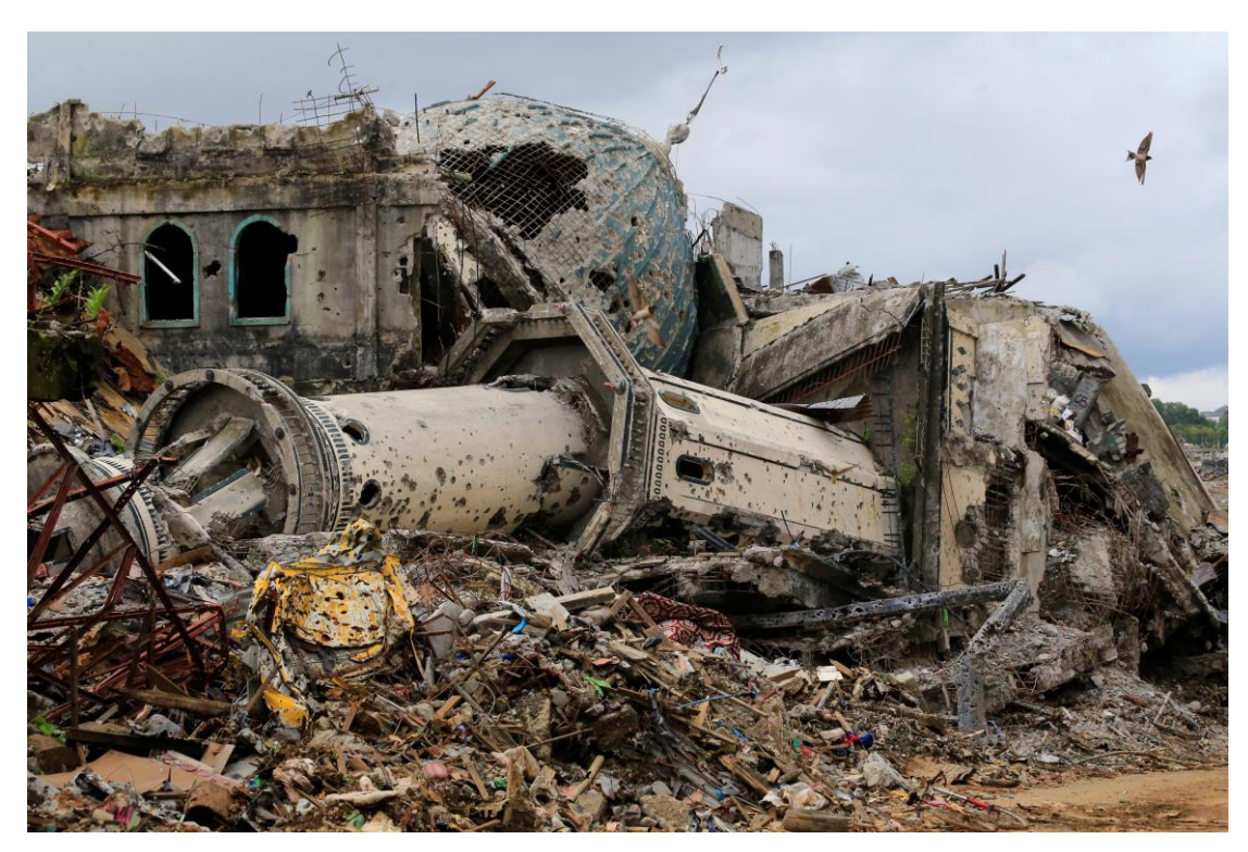
Damaged houses and a mosque are seen in Marawi city, 25 October 2017.

The extensive damage to the city, particularly the fact that large areas continued to be destroyed after the military had publicly stated that only a few militants remained alive, 110 underscore the importance of investigating whether the use of air and ground operations was consistent with the principle of proportionality under IHL. Amnesty International has analysed satellite imagery showing that between 3 September and 1 October entire neighbourhoods of Marawi went from having severe damage to what appears to be complete destruction, as a result of government strikes (see images below). This destruction all occurred weeks after the government had stated that fewer than 40 militants remained in the city. 111