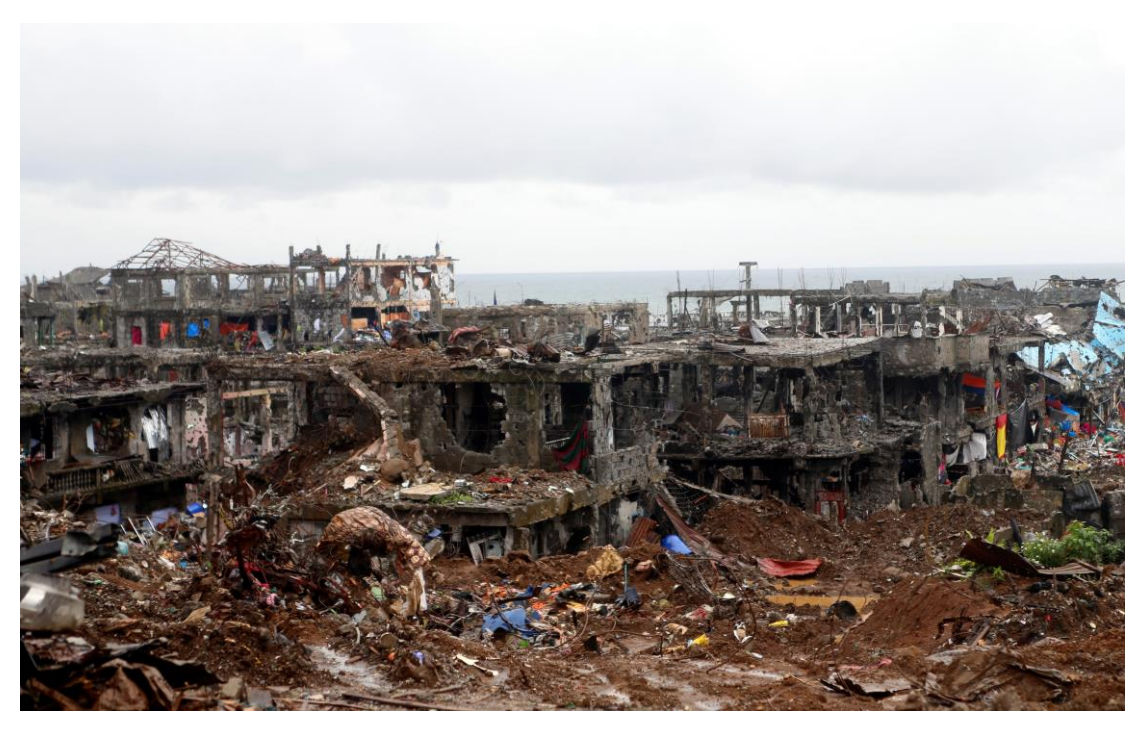
A general view of the damage in the eastern part of Marawi city where the fighting was mostly concentrated, 17 October 2017.

Images and video footage circulated in the media – along with satellite imagery obtained by Amnesty International and other organizations – show the significant damage the city sustained, including many half-standing buildings pockmarked with bullets and shrapnel, streets covered in rubble, and damaged mosques.<sup>109</sup>