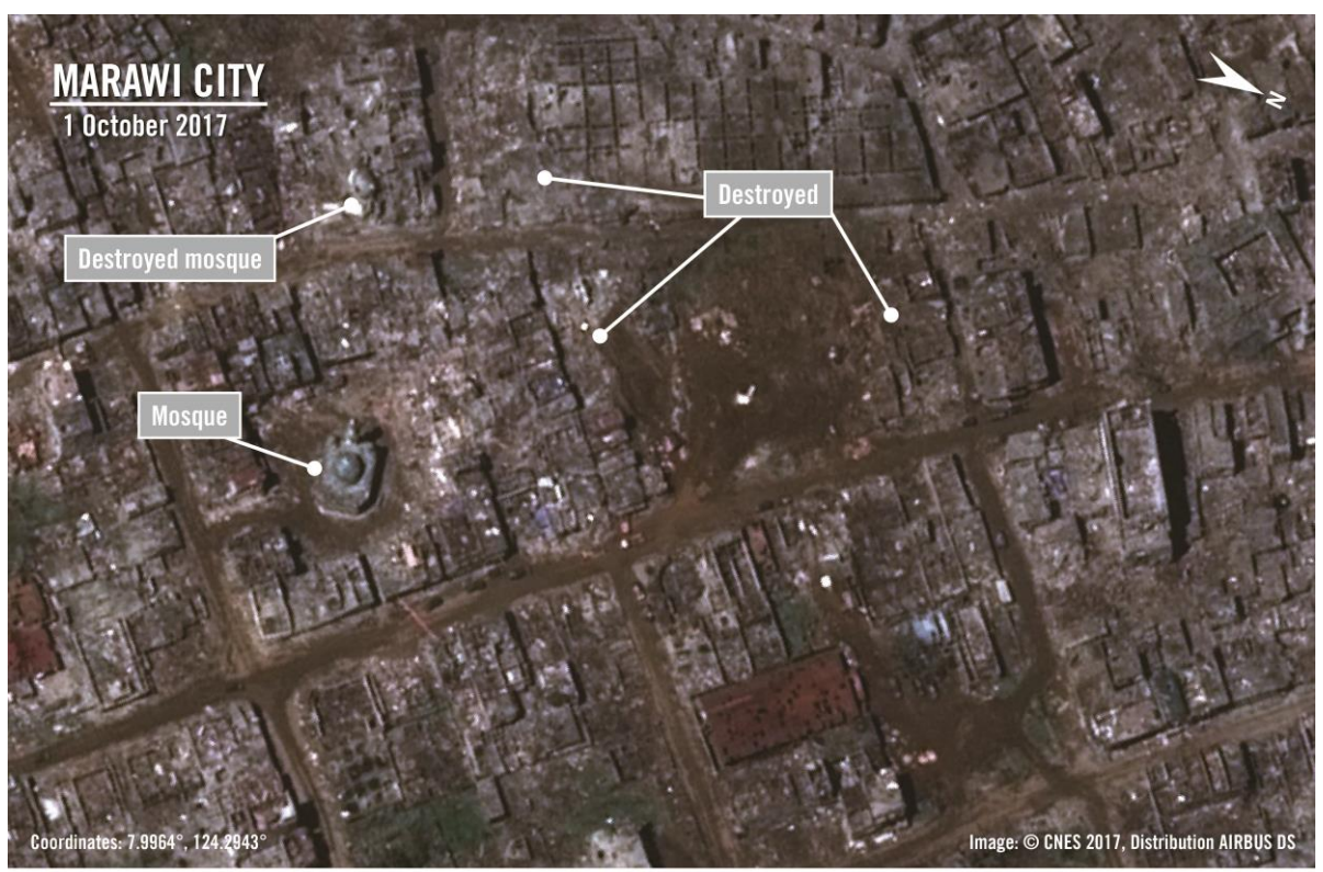
Between 3 September and 1 October 2017, entire parts in the battle area in eastern Marawi went from severe damage to being completely razed.