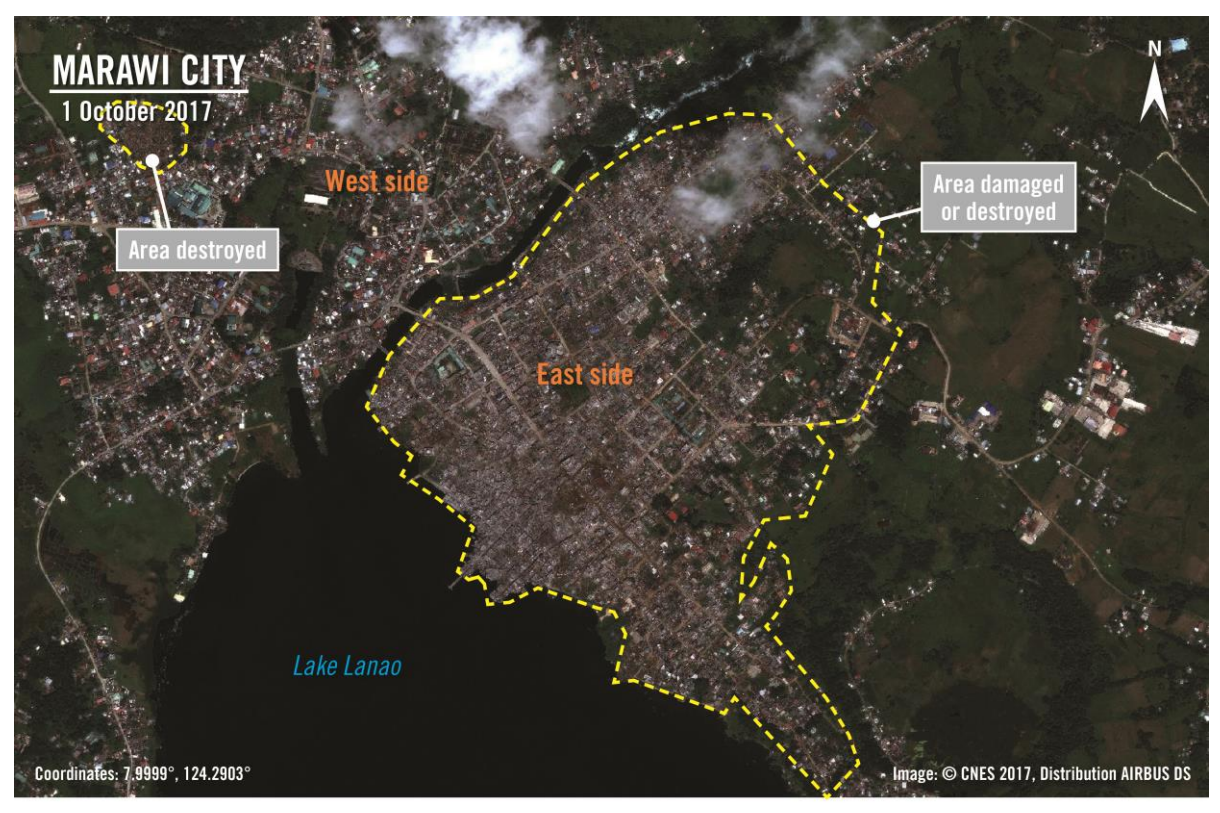
The lower satellite image from 1 October 2017 shows much of the east side of Marawi city destroyed along with parts of the west side, compared to what the city looked like in the upper image from 31 January 2017 before the fighting began.