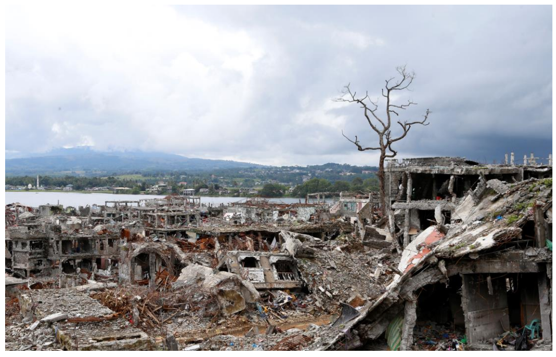
Mangled structures are seen in the main battle area in Marawi city, shown to the media during a tour by the military, 25 October 2017.

Five months of artillery and air strikes ravaged Marawi's infrastructure, and terrorized civilians trapped – or held-hostage – in the city. Huge swathes of the city were reduced to rubble. <sup>106</sup> While the extent of the