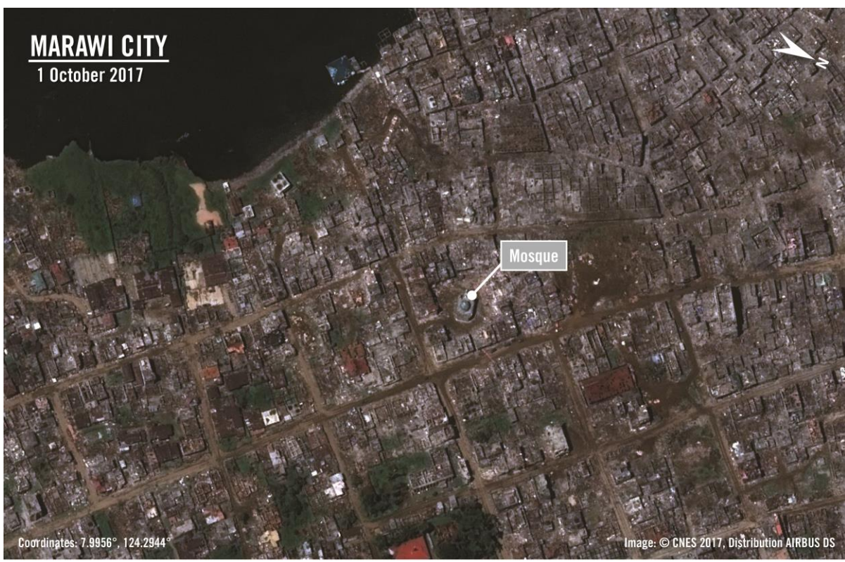
A closer look at the main battle area in eastern Marawi as seen in the lower satellite image from 1 October 2017 shows the area almost completely destroyed, compared to what it looked like in the upper image from 31 January 2017 before the fighting began.