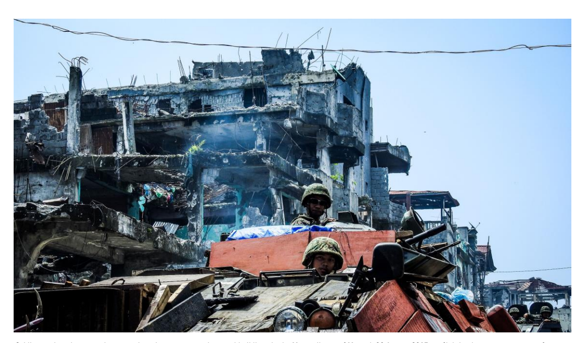
Soldiers on board armoured personnel carriers move past damaged buildings in the Mapandi area of Marawi, 30 August 2017, as fighting between government forces and militants entered its 100th day.

"We were not able to sleep because of the air strikes and gunfire. ... For 38 days we drank rain water. ... I tried to escape but bombs were falling near our building. ... When we did finally leave [as we were walking to bridge], we saw dead bodies decaying in the street. ... When we arrived at the bridge one of the Philippine [army] snipers waved at us to come faster. Then we were rescued by the military. Then we were turned over to the police."