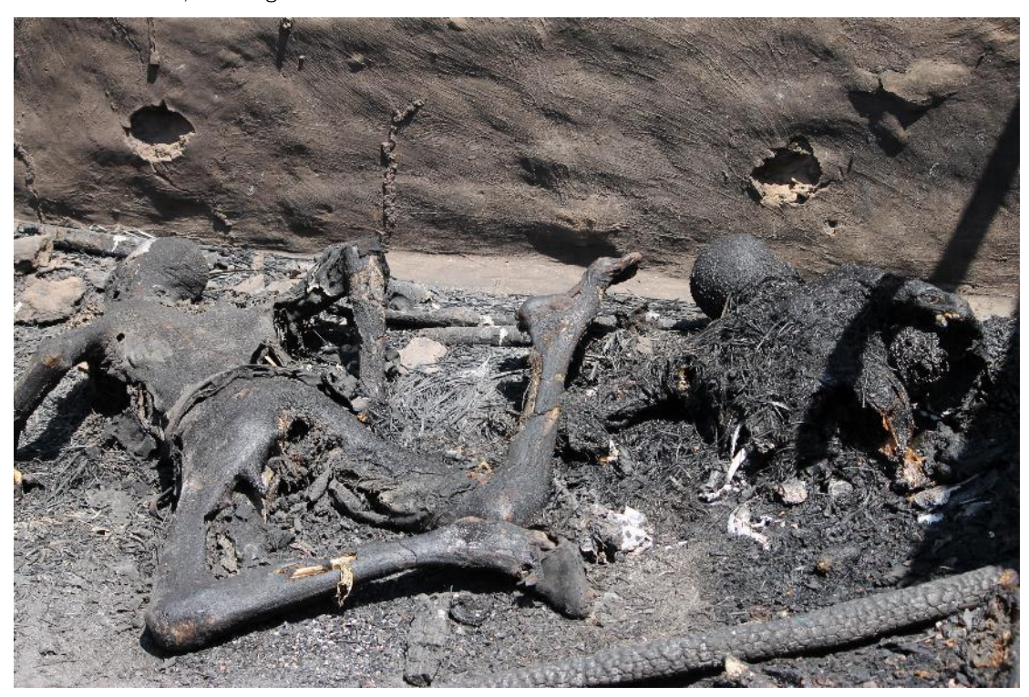
Burned bodies of civilians killed outside Yei, South Sudan, November 2016

that the soldiers would catch me and do the same to me. The following morning, I went to his burnt-out home and found his bones. Three other neighbours were also shot dead. The soldiers also took some animals with them, several goats and other animals." 15