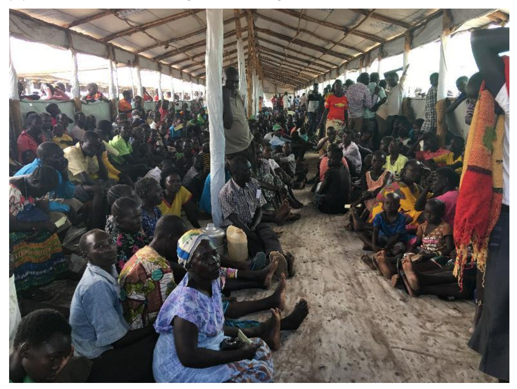
Recently arrived refugees from the Equatoria region waiting to be registered at a refugee centre in northern Uganda, June 2017

Government and opposition forces in South Sudan's Equatoria region, have committed war crimes and widespread and serious human rights abuses against civilians. Men, women and children have been shot, hacked to death with machetes and burned alive in their homes. Women and girls have been gang-raped, some after having been abducted. Homes, schools, medical facilities and humanitarian organizations' compounds have been looted, vandalized and burned down. Such atrocities have already forcibly displaced hundreds of thousands of the region's inhabitants, and are continuing. Many of the displaced have fled the country and are now living as refugees in neighbouring Uganda and the Democratic Republic of the Congo (DRC). Others are internally displaced within the region, living in fear of the ongoing violence and in dire humanitarian conditions. Both government and opposition forces have used food as a weapon of war, denying civilians access to food as a means to control their movement or force them out of their homes and off their land. As a result, in a region previously considered as South Sudan's breadbasket, the remaining population faces acute food shortages and increasing malnutrition.