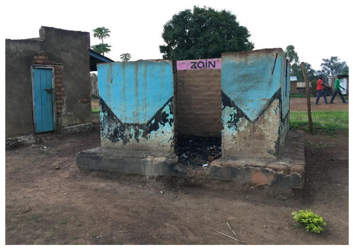
Burnt house in the Gigomoni neighborhood of Yei, June 2017

The violence and insecurity – with residents at risk of attacks in their homes, in their fields, in markets, on roads - have forcibly displaced close to a million people from their homes in the Equatoria region and disrupted food cultivation and trade to such an extent that, in the space of a year, the food-rich region which could feed millions has become a place where even the small percentage of inhabitants who remain are facing acute hunger and malnutrition.