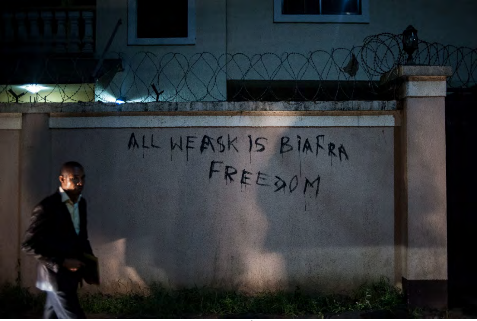
This picture taken on May 3, 2016, shows Pro-Biafran graffiti messages in Port Hardcourt.

These arrests and detentions are arbitrary, insofar as the authorities are arresting and detaining people for the exercise of their human rights, in particular, their right to peaceful assembly, association, and freedom of expression, by means of an abusive interpretation of the crimes of treason and belonging to an unlawful society.