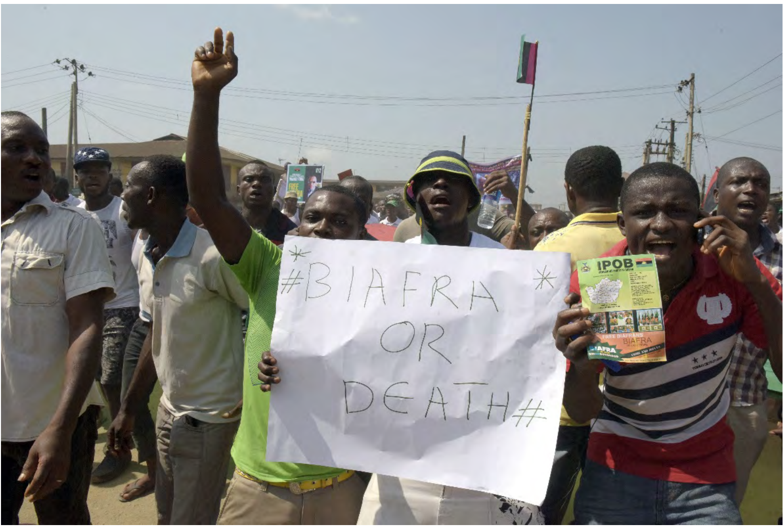
Pro-Biafra supporters hold a placard as they march through the streets of Aba, southeastern Nigeria, on 18 November 2015.

Under the UN Code of Conduct for Law Enforcement Officials and the UN Basic Principles on the Use of Force and Firearms by Law Enforcement Officials (Basic Principles), police may use force only when strictly necessary and to the extent required for the performance of their duty. Basic Principle 9, which reflects the international law obligation to respect and protect the right to life, expressly stipulates that they must not use lethal force (firearms) unless it is strictly necessary – that is only when less extreme means are insufficient – to defend themselves or others against the imminent threat of death or serious injury or to prevent a grave threat to life; intentional lethal force should not be used except when strictly unavoidable in order to protect life. Firearms should never be used to disperse an assembly and indiscriminate firing into a crowd is always unlawful. Tear gas may only be used for the purpose of dispersing a crowd in a situation of more generalized violence.