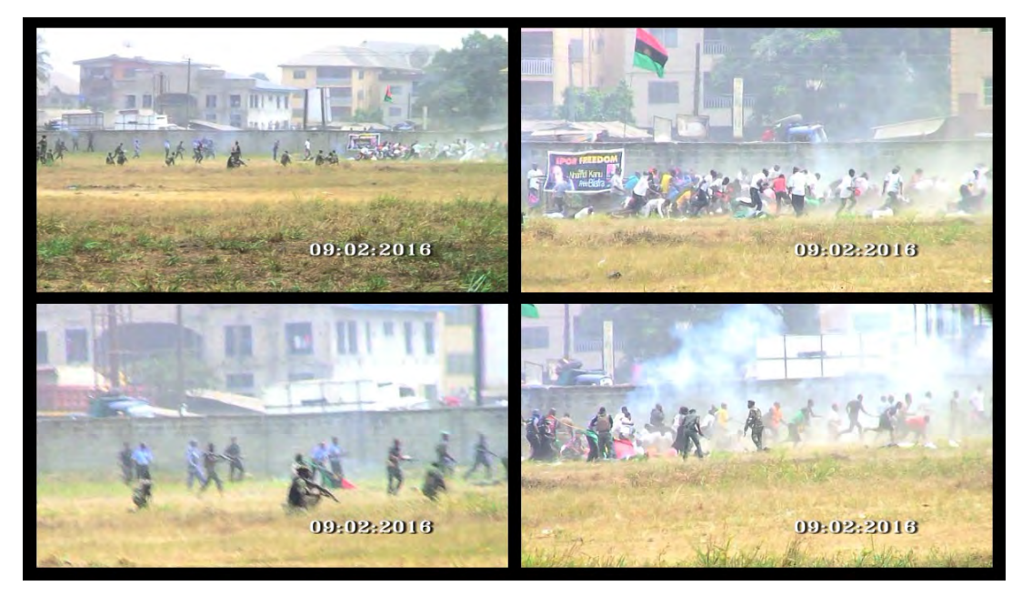
Without warning, the police shot teargas and immediately after, soldiers shot live ammunition.

"The way they squatted with guns pointing directly at the crowd, I was terrified. I kept praying I make this one out alive. The first attack was tear gas... I was still struggling with the tear gas when I saw them shooting. These soldiers were shooting close range. Everybody ran in different directions."