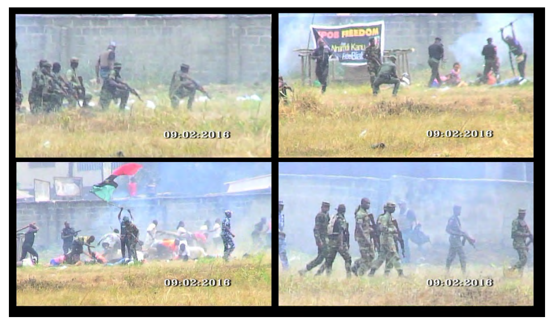
Soldiers and police just after they shot at the peaceful IPOB members and supporters. They beat those who did not run away.

Similarly, other people detained by the military told Amnesty International that they were beaten and illtreated. A man who was detained in Onitsha Barracks after the Remembrance Day shooting on 30 May 2016 told Amnesty International: "Those in the guard room [detention] were flogged every morning. The soldiers tagged it 'Morning Tea'."<sup>171</sup>