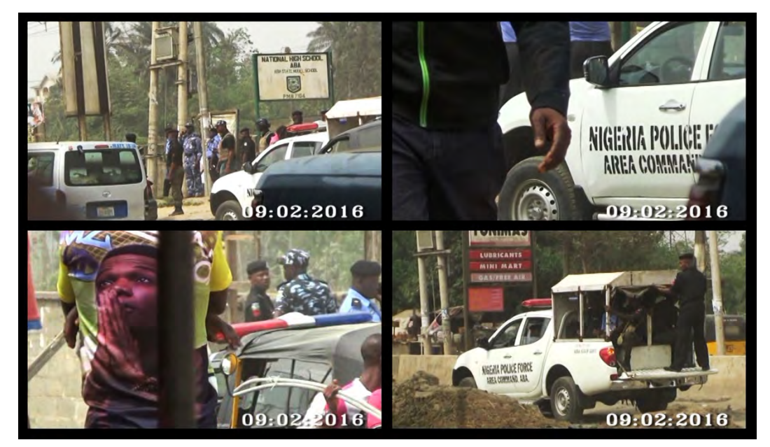
Aba, 9 February 2016. Despite video evidence of the police and military units present at Aba High school, where peaceful IPOB members and supporters were gunned down, there has been no independent investigation.

The only recent step reportedly taken by the military to investigate allegations of human rights violations was on 22 March 2016, when the Chief of Defence Staff set up an internal committee to investigate all allegations of human rights violations, including those relating to the armed conflict in the northeast, to the excessive use of force against members of IMN and to IPOB.<sup>214</sup> At the time of writing, it is unclear if the committee has drafted a report or even interviewed any witnesses.