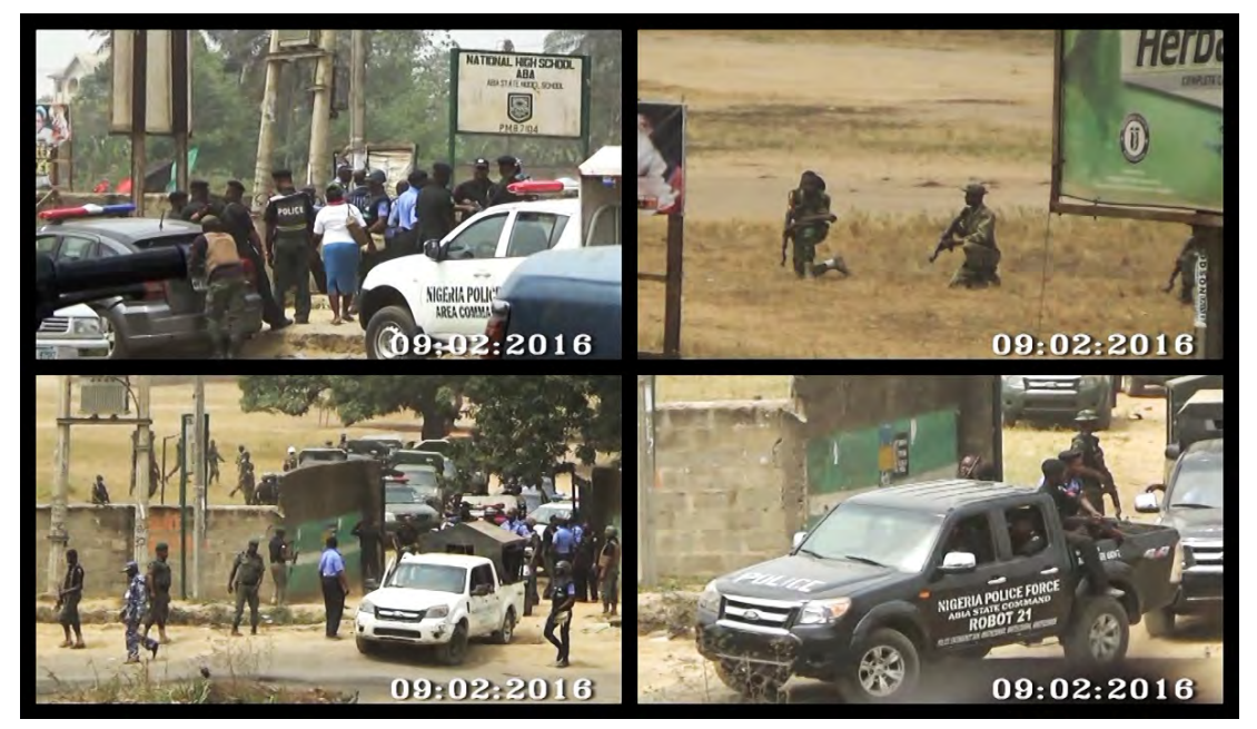
Police and military as they leave Aba High School.

In this case, however, the videos show that the crowd did not pose a threat at all. All witnesses interviewed by Amnesty International confirmed that they were unarmed and did not engage in confrontation with the security forces. Their own stewards controlled the crowd. Consequently, the use of firearms was not only unlawful, the killings by the military were clearly intentional and amount to extrajudicial executions.