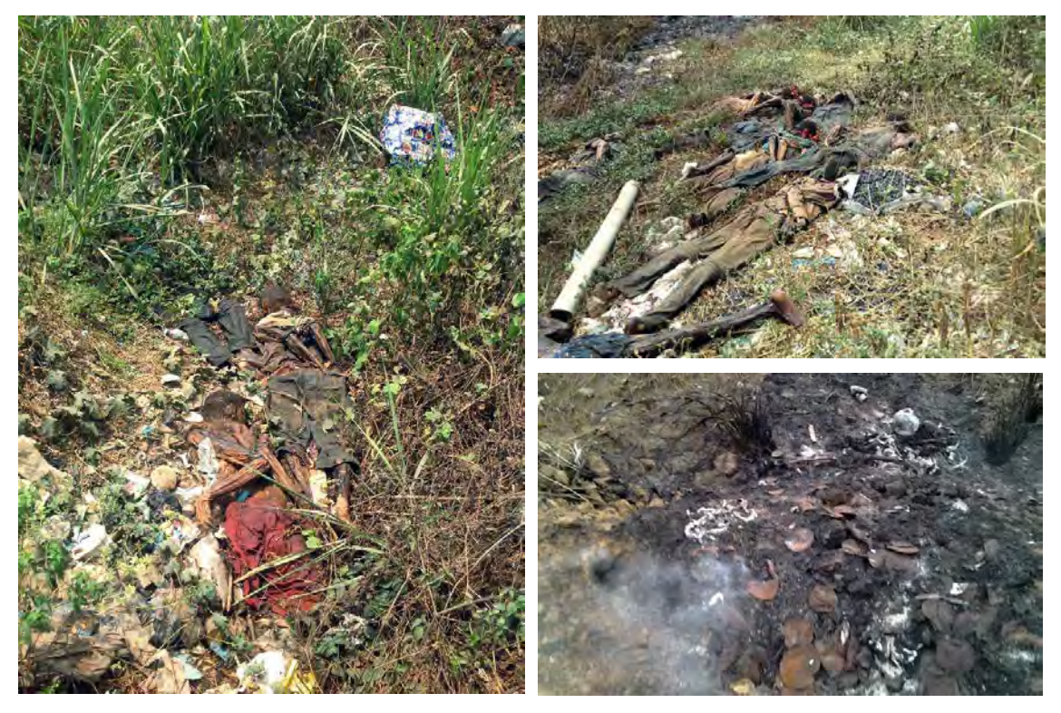
13 corpses were found on 13 February in a borrow pit along the Aba – Port Harcourt expressway. According to local human rights defenders, these were men who were taken away from the school by the military on 9 February. On 2 March the corpses had been burned.