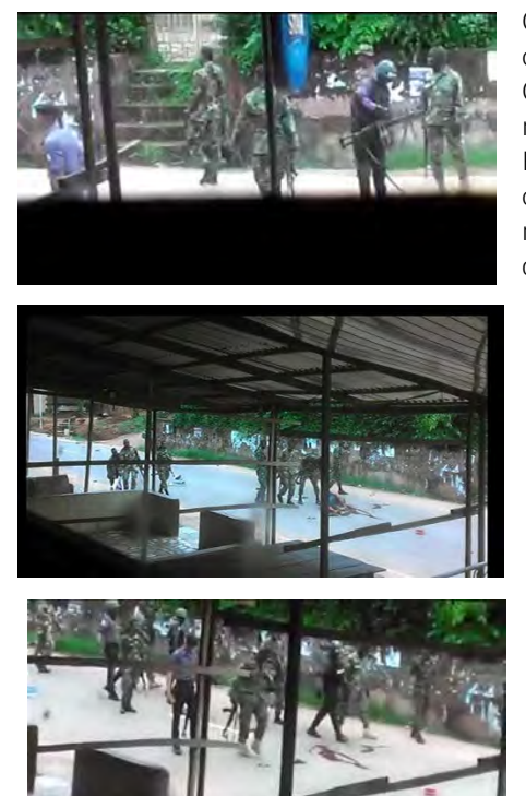
Stills from video footage showing an operation by security officers of the joint task force Operation Kpochapu in Nkpor, Obosi Road.

On the night of 29 May, soldiers and police stormed the compound of St Edmunds Catholic church in the Nkpor area of Onithsa, where hundreds of people who had come from neighbouring states were staying for the night ahead of the Remembrance rally. A 32-year-old hair-dresser who was in the church compound told Amnesty International: "At about midnight we heard someone banging the door. We refused to open the door but they [the soldiers and police] forced the door open and started throwing tear gas. They also started shooting inside the compound. People were running to escape. I saw one guy shot in the stomach. He fell down but the tear gas could not allow people to help him." 98 Amnesty International interviewed seven people who stayed in the church that night. They all said that at least one person died and four were injured during this incident. One of the injured men later died of his injuries in hospital.<sup>99</sup> The soldiers and police left without making any arrests.<sup>100</sup>