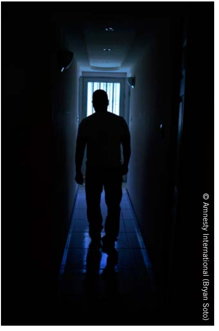
The five men were acquitted and released in 2014 after intense campaigning by relatives and human rights defenders. The complaints of torture remain unaddressed.