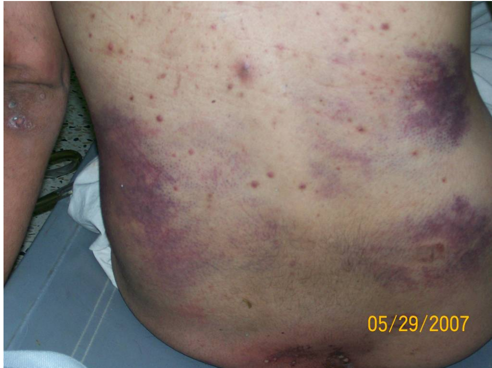
Marks of torture on 'Adnan 'Awad al-Jumaili's body

Some of the most recent deaths in custody happened on 12 May 2010, when seven detainees died while being transferred within Baghdad from Camp Taji to al-Rusafa Prison. Iraqi government officials stated that the cause of death was asphyxiation. The seven were among a group of nearly 100 detainees squeezed into two vans without any windows and which normally only carry about 20 people each. When one of the vans arrived in Baghdad, guards found that 22 detainees had collapsed. They were taken to hospital, but seven died. The government announced that an investigation had been set up. On 15 May the Human Rights Minister was reported as stating that those responsible for the deaths must be brought to justice. 79