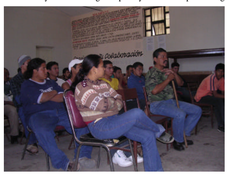
Central American migrants in Saltillo, Coahuila recounting their experiences to AI delegates. Undocumented migrants are vulnerable to abuses by police and private security guards, but rarely file official complaints.

The National Human Rights Commission carried out an investigation and found that at least 19 of the detainees had been tortured and recommended a full investigation, but the Jalisco state authorities refused to comply. <sup>98</sup> Amnesty International has also raised the case with the state authorities who stated that the allegations of torture were invented by demonstrators. The federal authorities have denied they have jurisdiction in the case. Amnesty International is not aware of any official facing disciplinary or criminal proceedings as a result of the abuses.