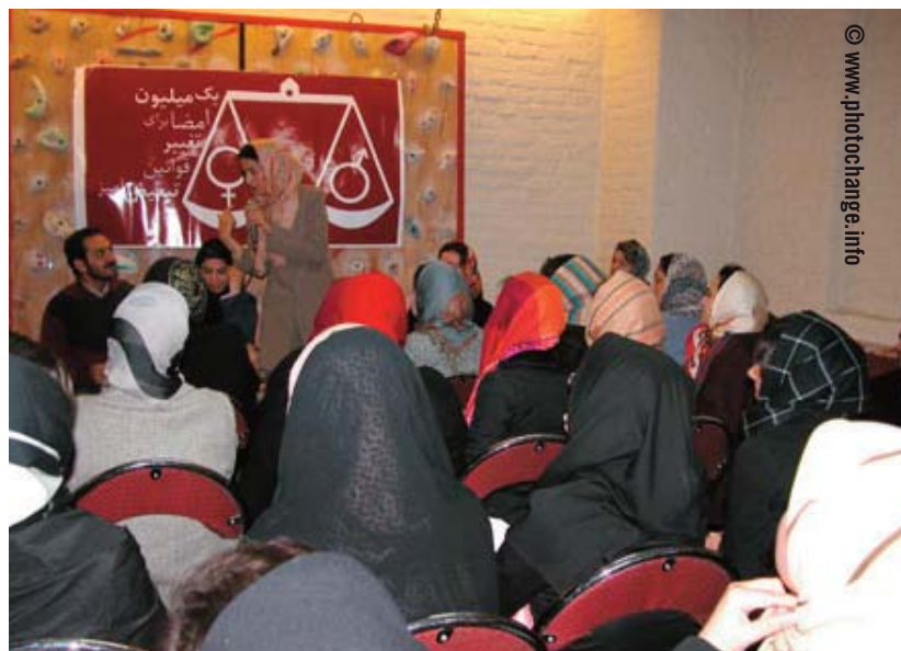
Members of the Campaign for Equality at one of their regular meetings.

According to the Declaration on the Right and Responsibility of Individuals, Groups and Organs of Society to Promote and Protect Universally Recognized