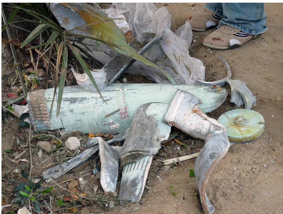
A white phosphorus carrier shell

Amnesty International found that the Israeli army used white phosphorus, a weapon with a highly incendiary effect, in densely-populated civilian residential areas in and around Gaza City, and in the north and south of the Gaza Strip. The organization's delegates found white phosphorus still burning in residential areas throughout Gaza days after the ceasefire came into effect on 18 January - that is, up to three weeks after the white phosphorus artillery shells had been fired by Israeli forces. Amnesty International considers that the repeated use of white phosphorus in this way in densely-populated civilian areas constitutes a form of indiscriminate attack, and amounts to a war crime. 3