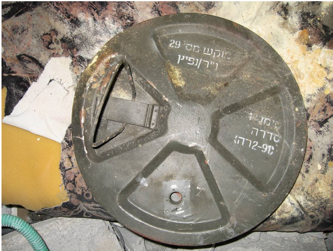
An Israeli anti-tank mine with Hebrew markings