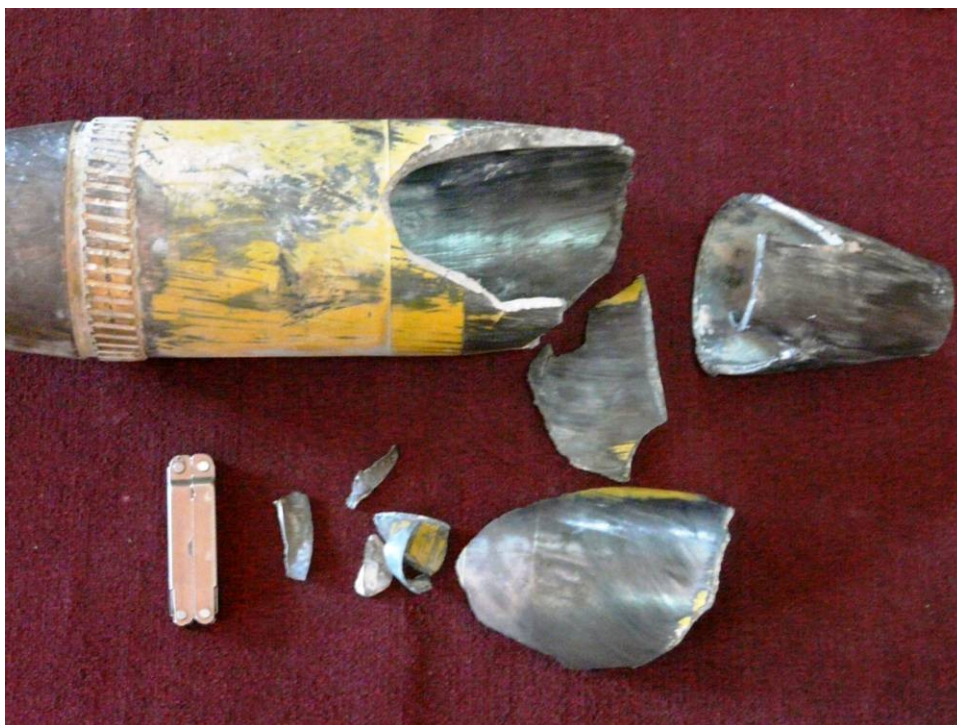
An artillery carrier shell which ejects a canister for illumination

Amnesty International delegates encountered 155mm M485 A2 illuminating shells used by the IDF which had landed in built up residential areas in Gaza. These eject a phosphorus canister, which floats down under a parachute. At least three of these carrier shells were found which had landed in people's homes. These shells are yellow and one had the following markings: TZ 1-81 155-M 485 A2. TZ is a known marking on Israeli ammunition.