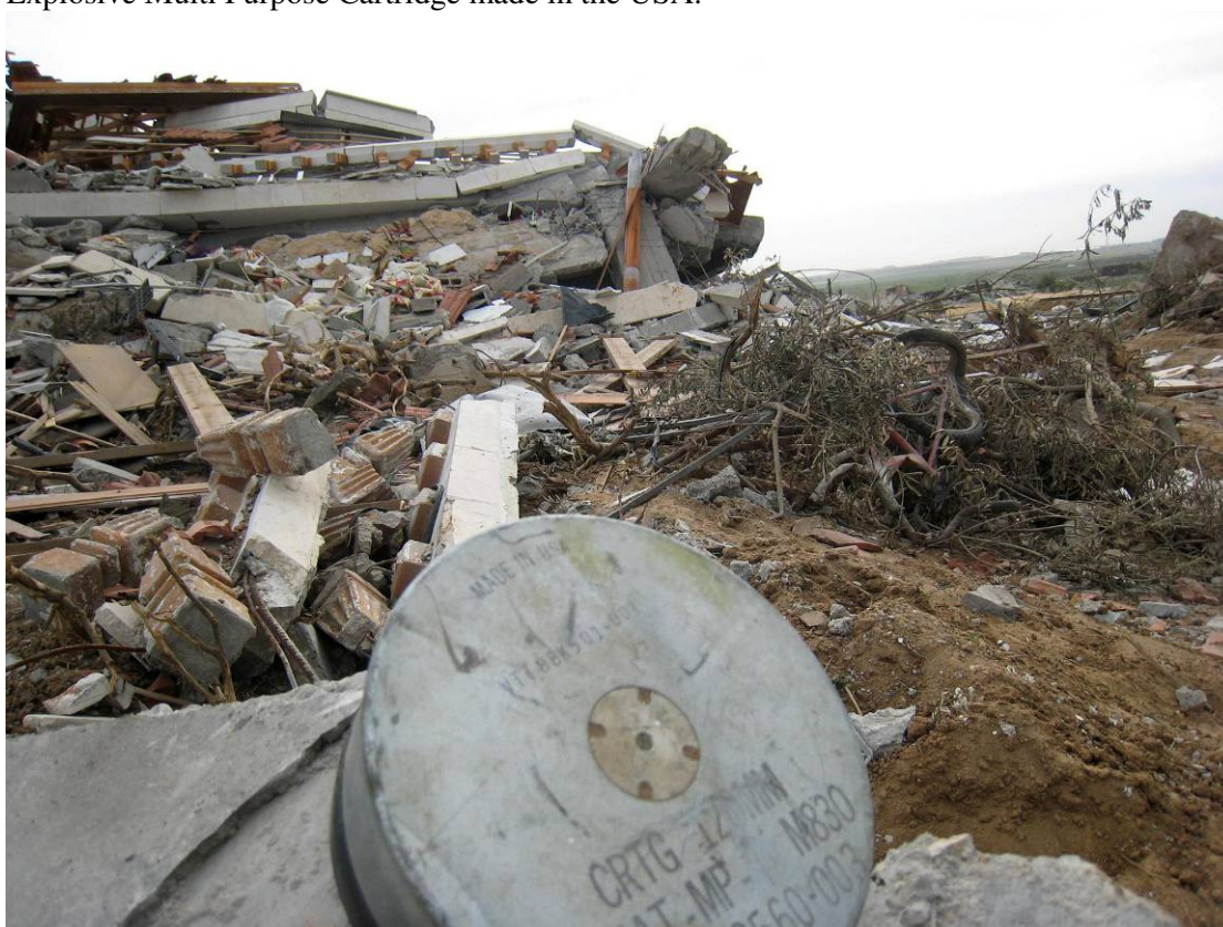
Base of tank cartridge found by Abu Abdullah Abu 'Ida outside his house

The markings on the base of one tank round found by Amnesty International delegates in Gaza at the destroyed house of the Abu 'Ida family indicated that it was a 120mm M830 High Explosive Multi Purpose Cartridge made in the USA.