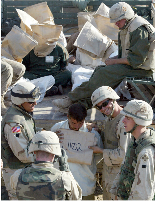
Mishahdah, Iraq: Soldiers from the US Army's 4th Infantry Division round up detainees during a July 2003 operation aimed at pro-Saddam Hussein insurgents. All of the men in the village were reportedly detained during the operation.