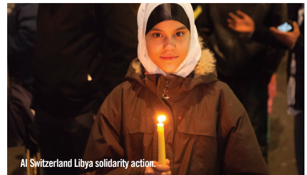
AI Switzerland Libya solidarity action.