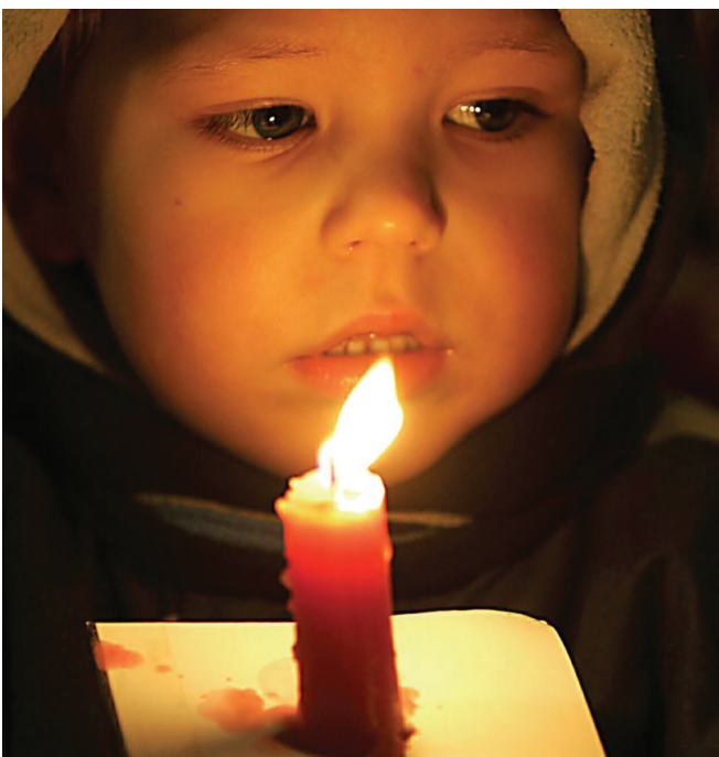
Child with candle at Amnesty International event

a newspaper article calling for the release of all people imprisoned because of their beliefs. More than a thousand individuals contacted him because they too wanted to do something about these injustices. They started the organisation that is now Amnesty International. Today, Amnesty International is a global movement of over 3.2 million supporters, members and activists in more than 150 countries and territories who campaign for the rights of every person in the world to be respected and upheld.